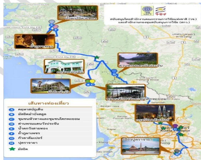
Diagram 1: Program Tours of Wang Prachan Border- Kuala Lumpur

2.1) Program Tours of Wang Prachan Border- Kuala Lumpur (Kuden Mansion- Mambang Mosque- Huathang& Kok Payom Villages- Wang Prachan Border- Thale Ban National Park- Wangsai Waterfall- Phuphaphet Cave- Kuala Lumpur- Putrajaya)