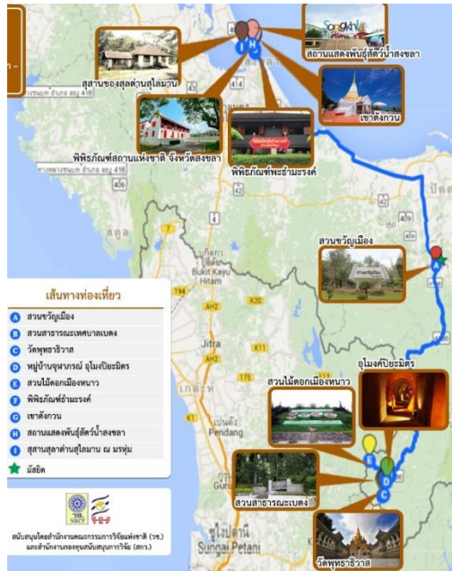
Diagram 2: Program Tours of Thailand Deep

2.2) Program Tours of Thailand Deep South (Wat Khuhaphimuk- Kwan Muang Public Park- Betong Public Park- Wat Buddhathiwat- Chulabhorn 10 Village- Piyamit Tunnel- Winter Flower Garden- Phiphitthammarong Museum- Songkhla Old City Walls- Songkhla National Museum- Kao Tnagkuan- Songkhla Aquarium- Had Samil- Sultan Sulaiman Tomb)