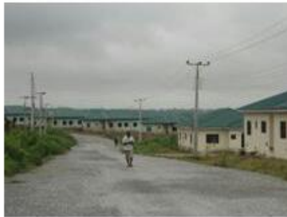
Aliyu Makama Housing Estate Bida comprises of 150 Housing Units (2&3 Bedroom Flat)