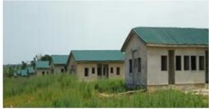
Talba Housing Estate Minna comprises of 500 Housing Units (2&3 Bedroom Flat) completed