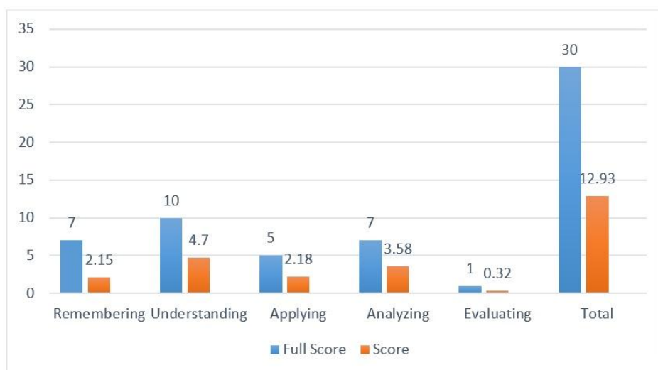
Figure 1: Pretest mean score of learning achievement before using Stem Education approach with 5 STEPs Learning Process.

The researcher diagnosed the science education contextual situation with both qualitative and quantitative methods. The researcher learned the context and situation of teaching by meeting and interviewing the student. Literature review, documentary research, and interviews with experienced science teachers and experts were done during the beginning of the academic year. The researcher diagnosed the extent of learning capacity by implementing a variety of means to gain preliminary data to locate areas of strength and weakness, and take steps to further develop it. A Pre-test was done to evaluate and gain better perception of the student competency in science.